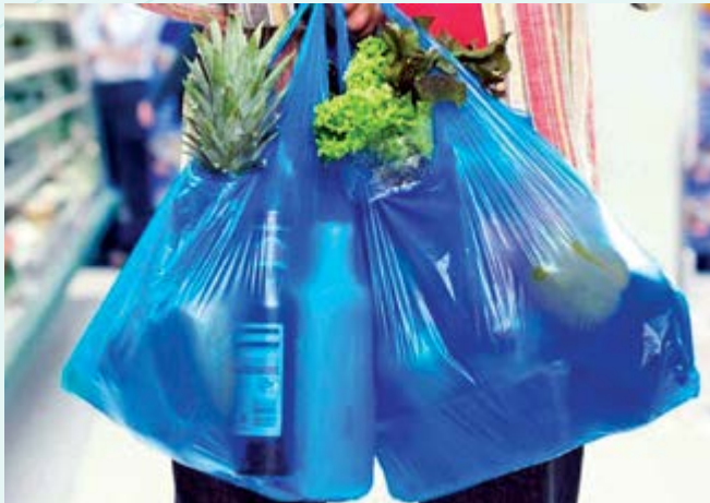
Burned plastic bags.